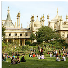
36 Hours in Brighton, England