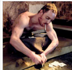
New York Film Festival: Quasi-Reality Bites Back